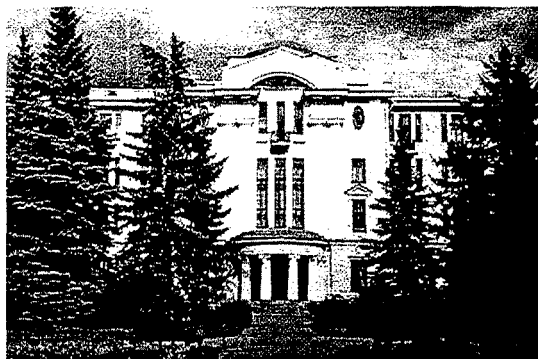
Front of the Herbarium (LE) – Komarov Botanical Institute, St. Petersburg.

I visited Trinity College Dublin from 20-24th March, including a brief stopover at the well-designed new herbarium in the Glasnevin Botanic Gardens. The herbaria at Edinburgh (11-15th April) and Cambridge University (6-8th May, 3rd June) were visited to answer a number of ABLO enquiries.