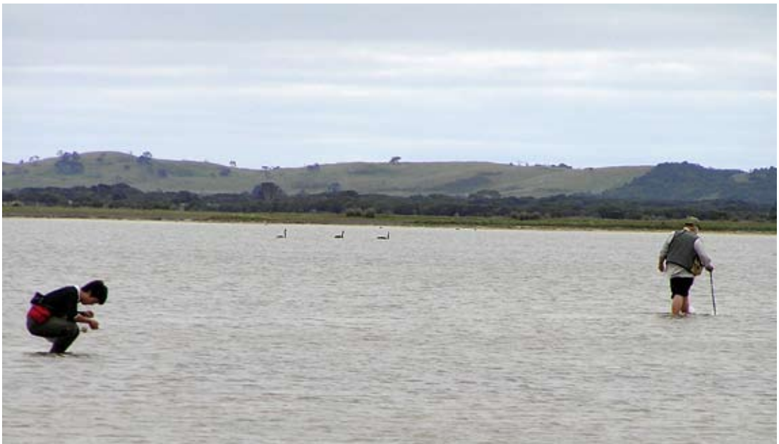
Surrey Jacobs and Yu Ito collecting Ruppia in South Australia in 2007.