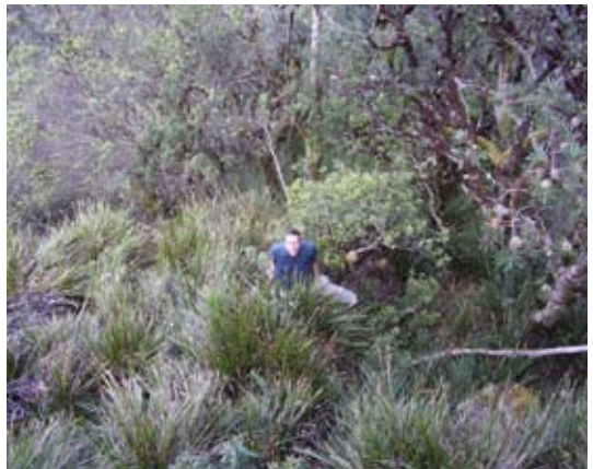
Duncan Jardine beneath Point lookout (New England National Park) with a yellow flowered Cassinia aculeata subsp. nova-anglica in hand that was named by Tony Orchard in 2009 in ASB, based on a Telford specimen from Point Lookout as the type.