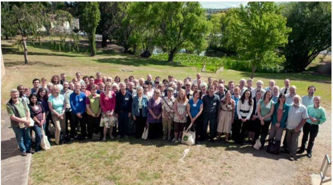
Delegates at the 2009 ASBS conference in Armidale.

the same general ecological niche, and despite a narrow contact zone, are noted for maintaining their identity in sympatry. While neither nuclear nor chloroplast genetic markers show clear differentiation, climatic niche modelling predicts both of the species' current distributions, with the GDR representing a boundary between the seasonally drier western climate and the wetter Pacific margin to the east. With fine-scale differences in leaf hair morphology a plausible adaptation to variation in climate, it is suggested that small changes in phenotype are sufficient to drive incipient speciation within the group.