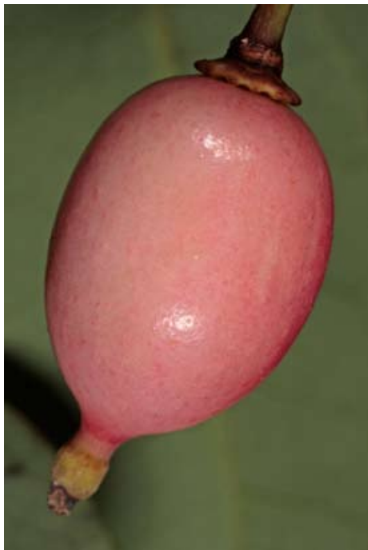
The lustrous pink developing fruit of Berberidopsis beckleri (Berberidopsidaceae) from the Eagles Nest walk in the New England National Park. (Photo: Russell Barrett).