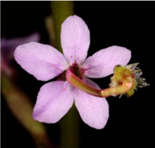
An unusual 5-petaled flower on Styliidium graminifolium near Ebor Falls.