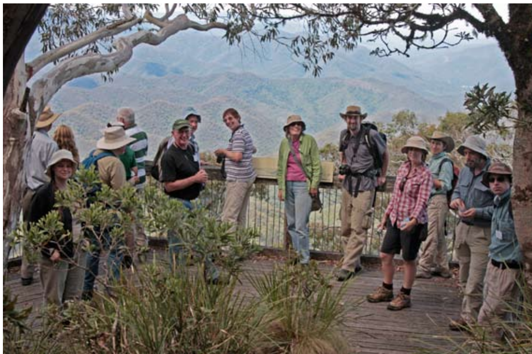
Some of the tour group at Point Lookout.

There was no need for the whistle at the end of the day and the bus departed on time. But about 5 minutes down the road the bus stopped while