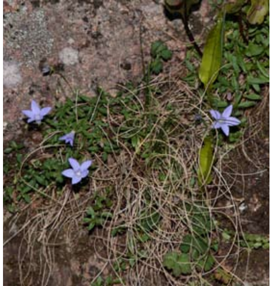
Whalenbergia telfordii at Point lookout.