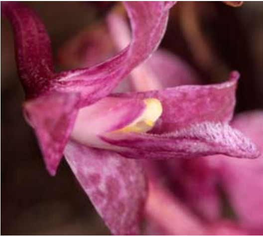
Dipodium sp. near Ebor Falls (Photo: Russell Barrett).