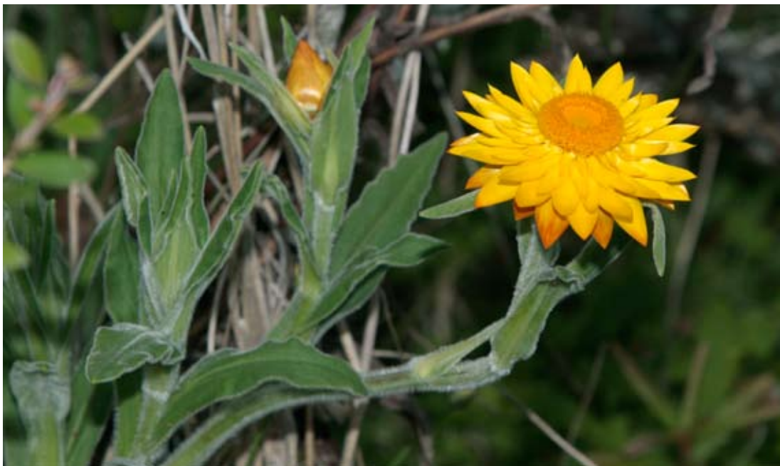
A superb Xerochrysum from the Eagles Nest walk in the New England National Park.